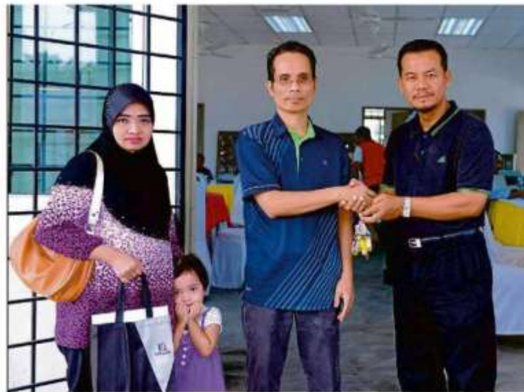
Home sweet home: A Taman Orkid Indah family receiving the keys to their house.

"This is also a sign that UDA is concerned about increasing Bumiputra property ownership," he said.